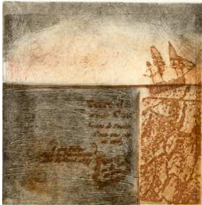
Page from artists' book Walga Rock 1999 10 x 10cm Lithography, etching and monoprint

Much of my work is about the compelling beauty and dramatic history of the open plains and the power that these seemingly barren places have over the imagination.